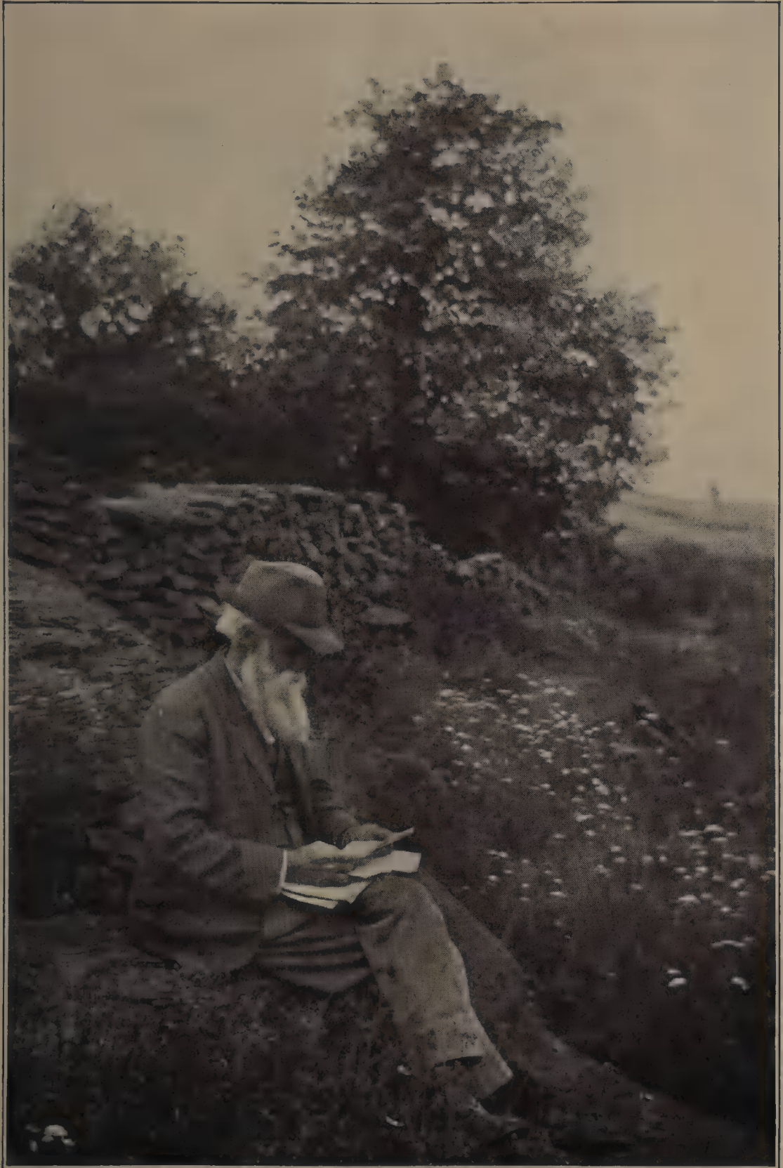
ONE OF MR. BURROUGHS'S FAVORITE SEATS